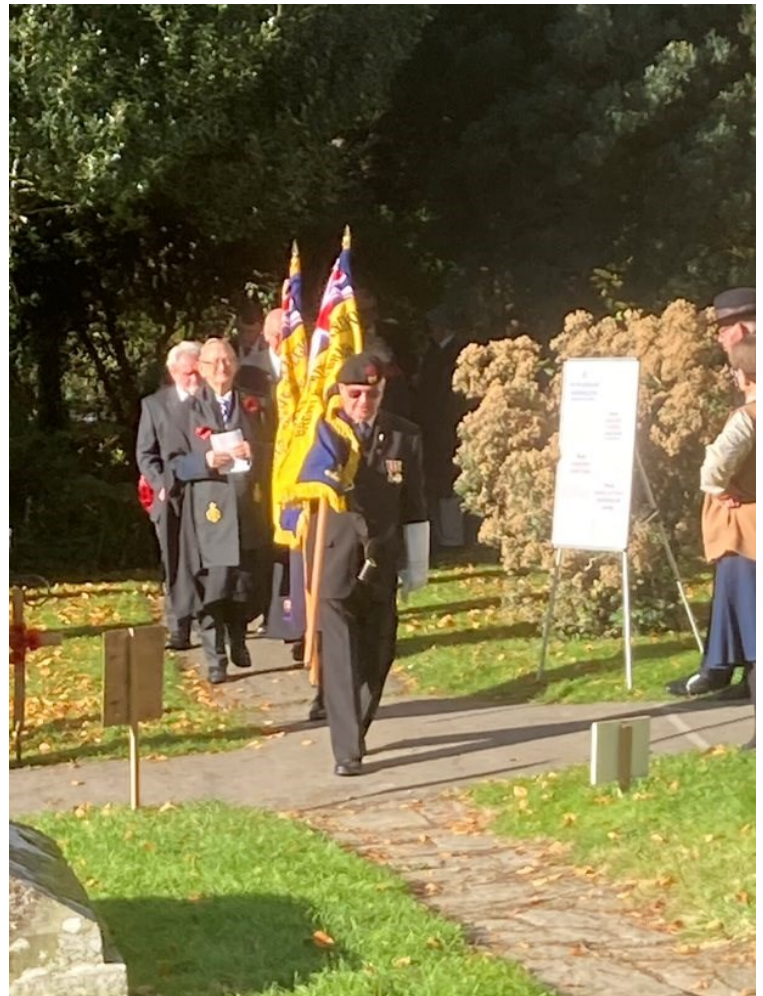
Remembrance Service at St Michael's