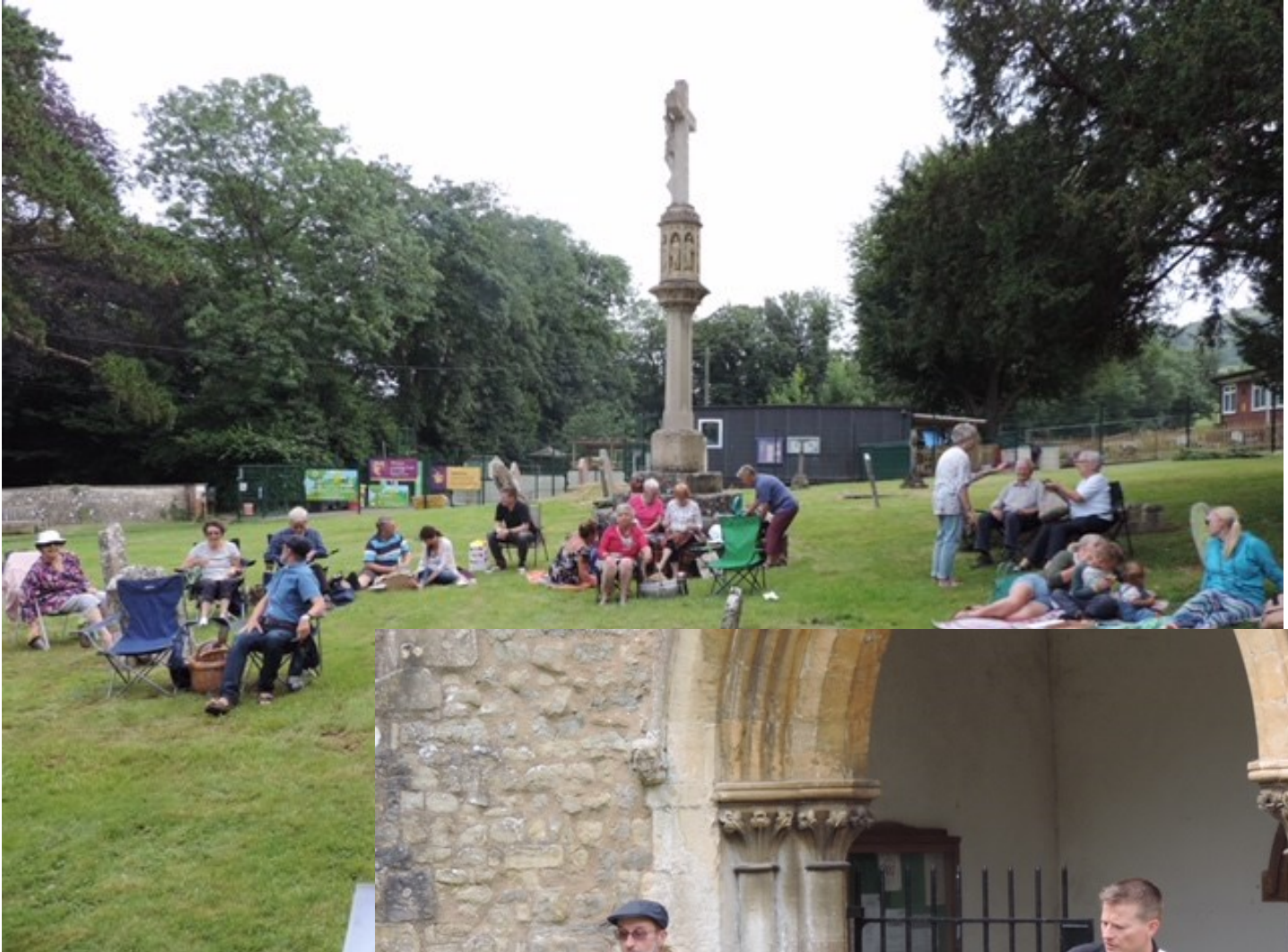
Picnic Church July 2021 at St Mary's