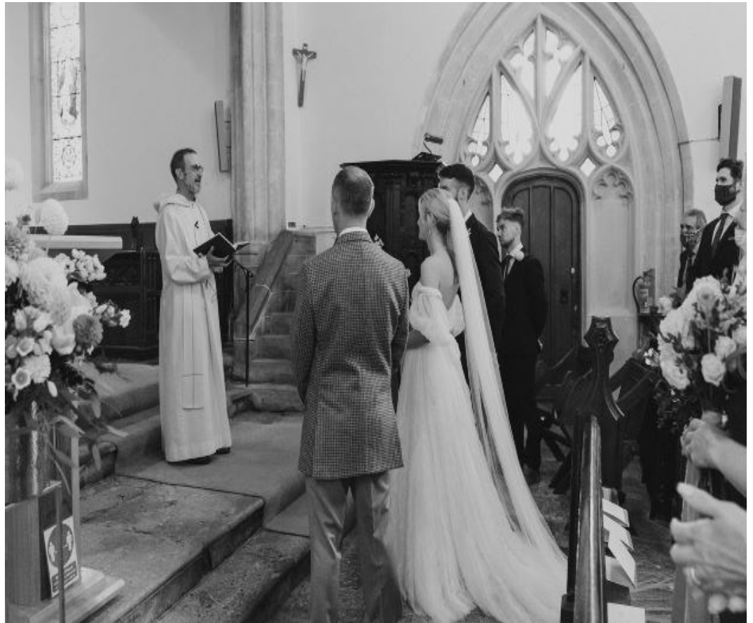
Wedding at St Michael's September 2021