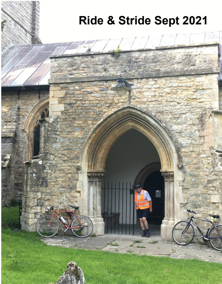
Ride & Stride Sept 2021