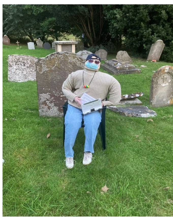
Scarecrow Trail at Brent Knoll