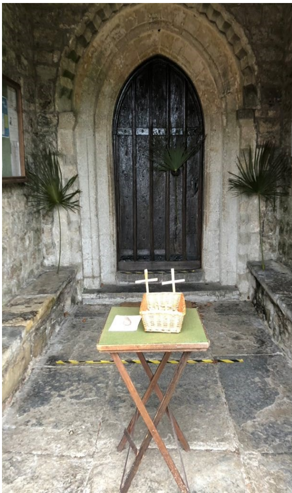
Palm Sunday at St Michael's