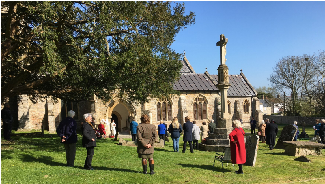
Easter Service April 2021 at St Mary's