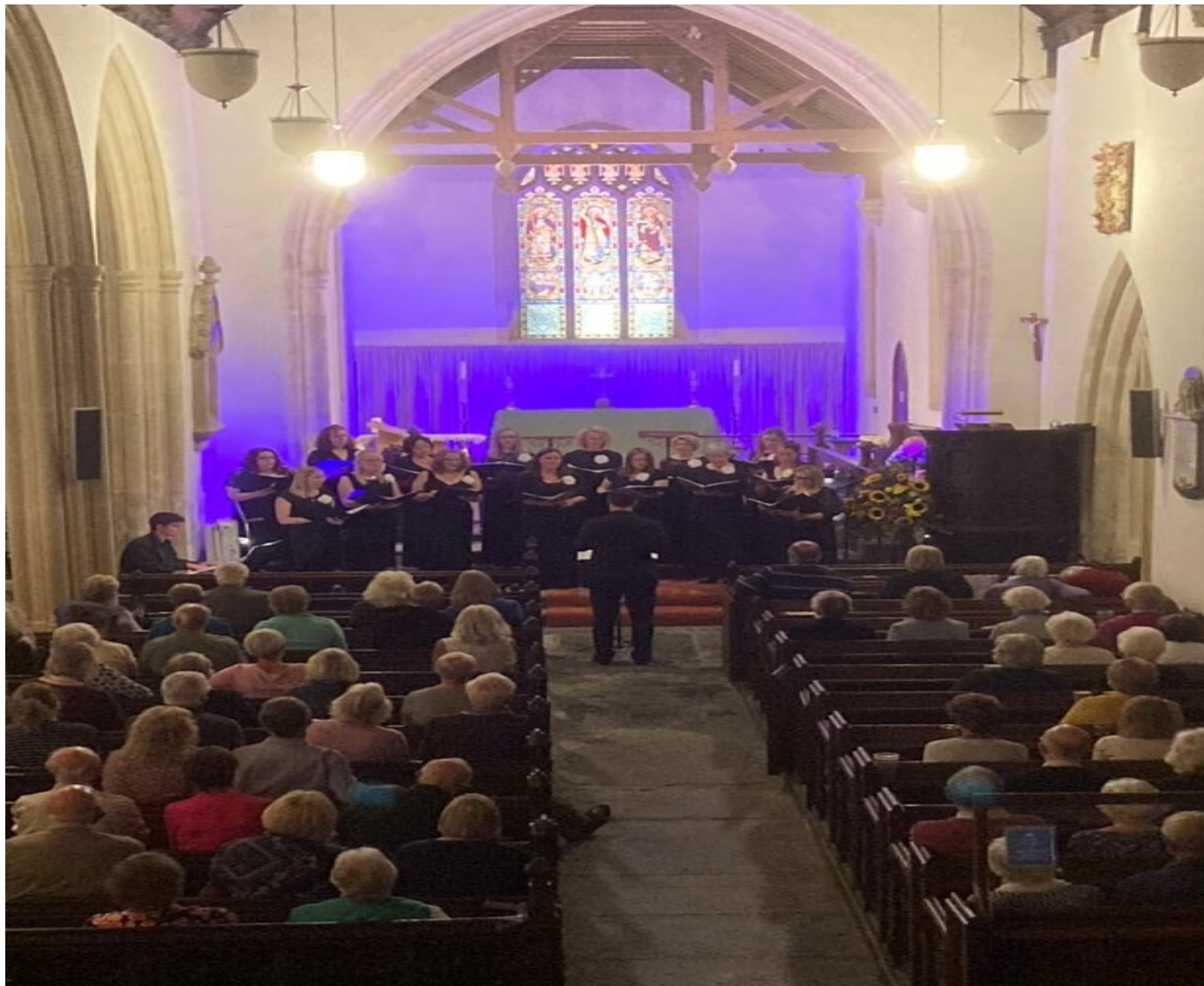
Taunton Military Wives Choir Concert, St Michael's, September 2021