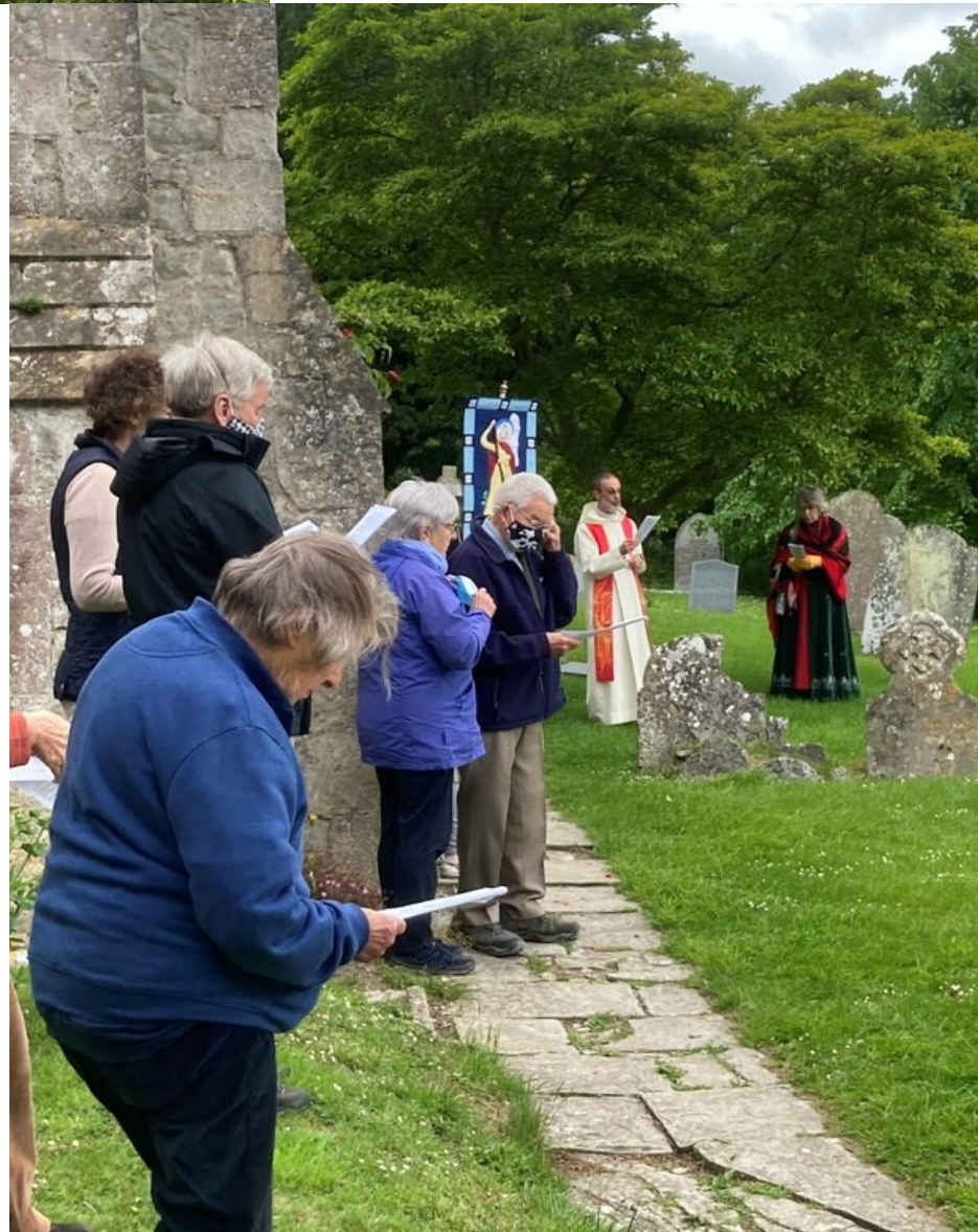
Dedication of St Michael's Banner