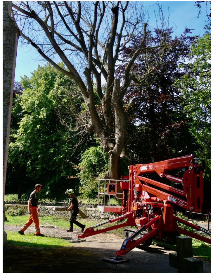
Felling of the wych elm in the Churchyard