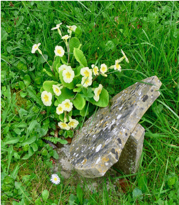
Spring in the churchyard