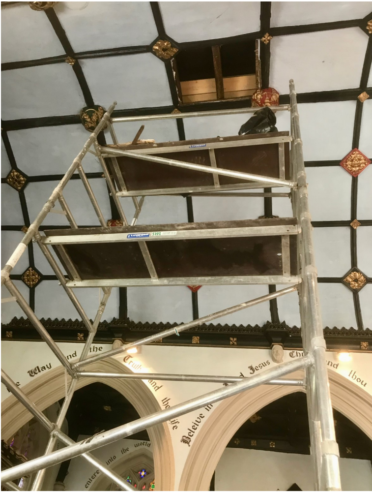
Repairs to a ceiling panel