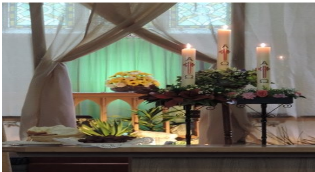
Victoria Daintree Church Warden

It is a privilege to serve God in our journey together in this beautiful village.